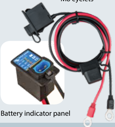
Battery indicator panel