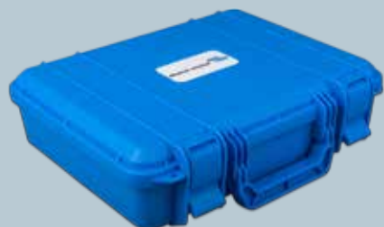
Carry Case for Blue Smart IP65 Chargers and accessories